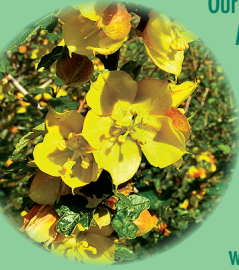
California flannelbush flowers resemble hibiscus.

TRY THIS FIRESAFE, DEER-RESISTANT NATIVE PLANT IN YOUR YARD!