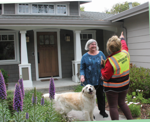
A District Defensible Space Inspector discusses fire safety with a resident during her rounds in the forest.