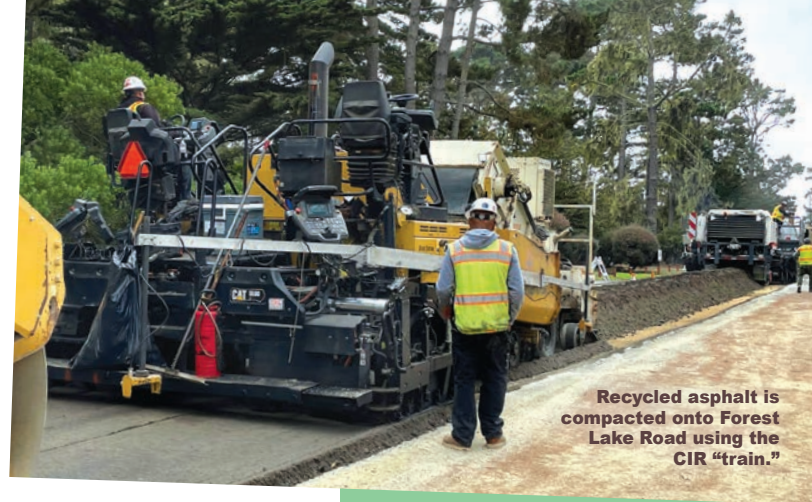
Recycled asphalt is compacted onto Forest Lake Road using the CIR “train.”

We are delighted that the project received a Public Works Project of the Year award from the American Public Works Association, Monterey Bay Chapter. The merit award was presented for excellence in cooperative partnership, management, and cost-effective delivery.