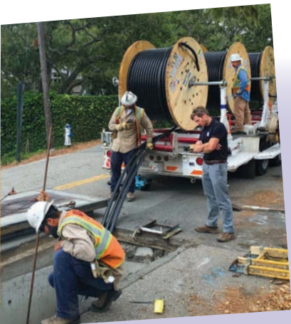
PG&E crews feed electrical lines into a new underground substructure.