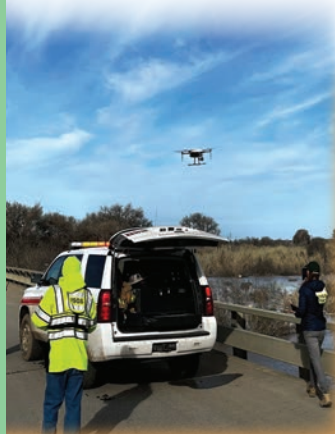
District pilots deploy a drone to assess flood damage after the Pajaro River levee breach.