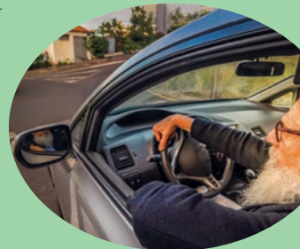
Thieves sometimes watch houses to determine when they are left unoccupied. Make note of unfamiliar vehicles that might be casing your neighborhood.

Thank you for helping us keep our community safe!