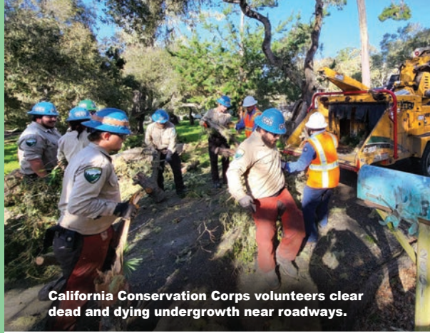
California Conservation Corps volunteers clear dead and dying undergrowth near roadways.