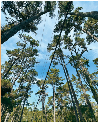
Power lines that run through the forest will be relocated to reduce outages from downed trees.