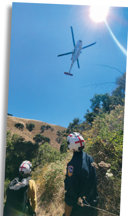
PBCSD fire personnel practice rescue maneuvers at Toro Park with the CAL FIRE Hollister helitack crew.

With five new members from the Pebble Beach Fire Department and five more from our battalion partners, the Highlands and Cypress Fire Protection Districts, our local USAR now has (Cont. on page 3)