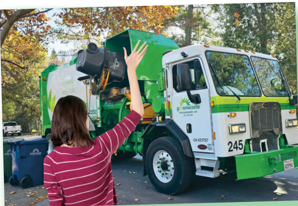
NICE PERK Your GreenWaste driver can move your carts to or from the curb at no additional charge.

▶▶▶ E-bike input and Emergency Preparedness insert inside! ◀◀◀