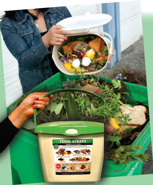
Pick up a free food scraps bin at the PBCSD office—available while supplies last!

Presorted Standard U.S. Postage PAID Pebble Beach, CA Permit No. 5